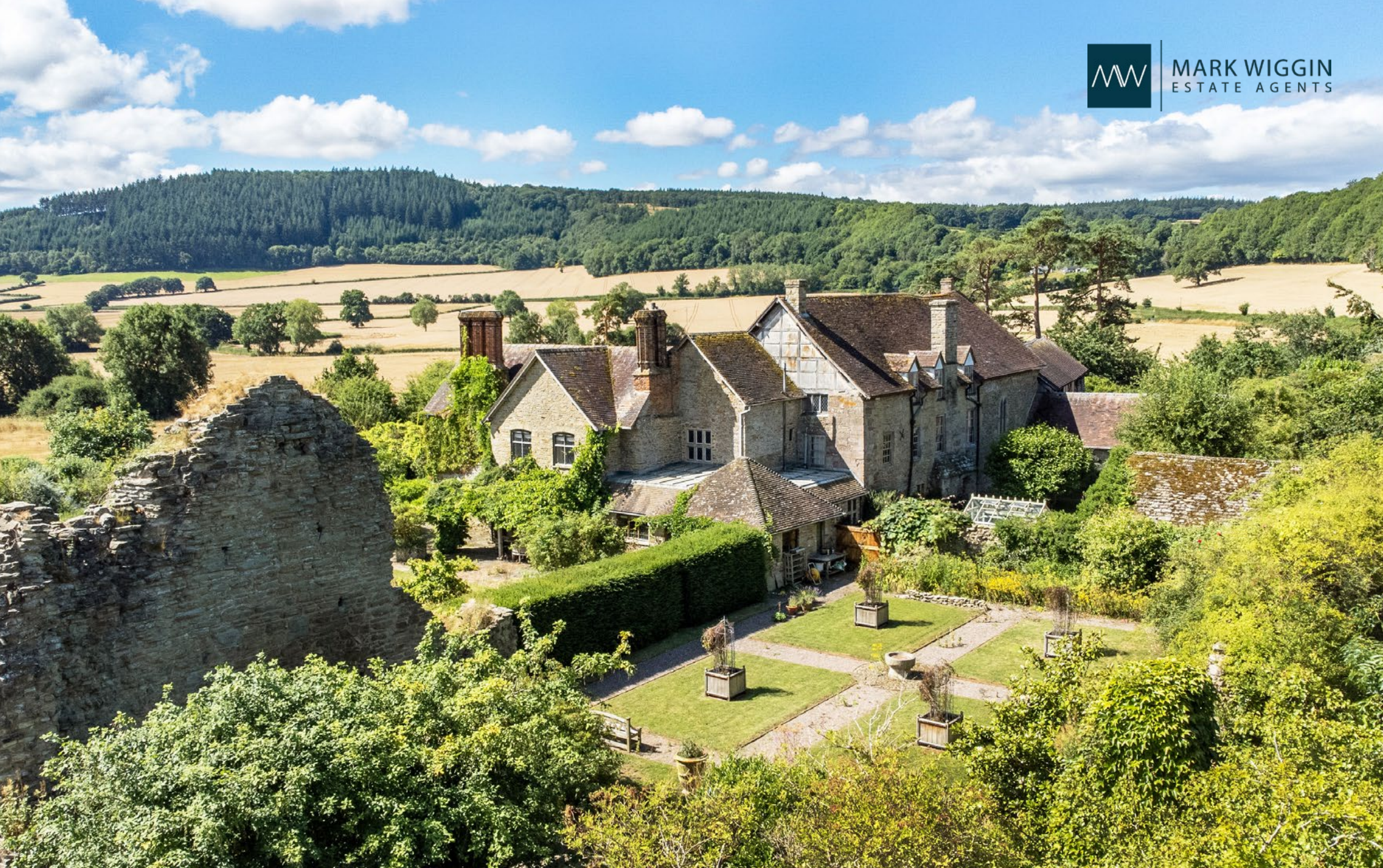
Wigmores Abbey Adforton, Herefordshire, SY7 0NB