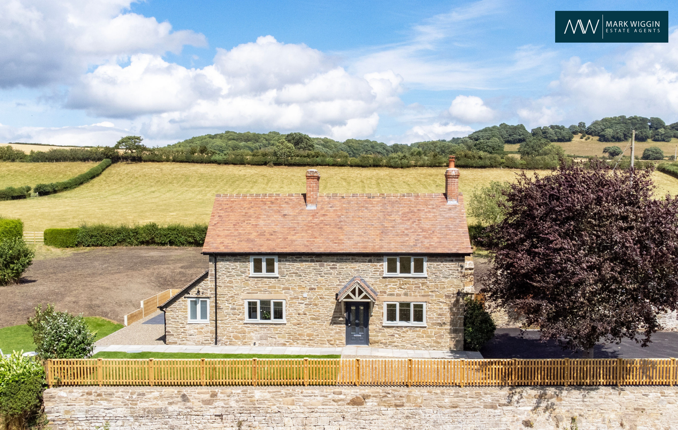
1 Halford Cottage Halford, Craven Arms, Shropshire, SY